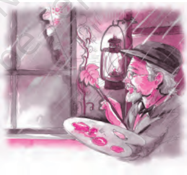
The Last Leaf/ 47

The next morning Sue came and sat on Johnsy's bed. Taking Johnsy's hand in hers she said, "I have something to tell you. Mr Behrman died of pneumonia this morning. He was ill for only two days. The first day the janitor found him on his bed. His clothes and shoes were wet and he was shivering. He had been out in that stormy night."